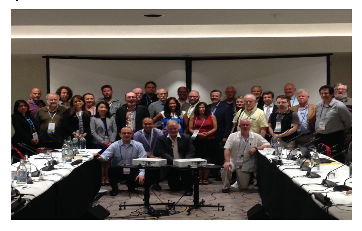
2014 ICANN London NARALO Group Shot