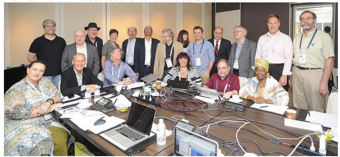
The 2015 NomCom at ICANN 52 in Singapore

The Nominating Committee met face-to-face in Singapore, 8 - 12 February, 2015, during the 52<sup>nd</sup> meeting of ICANN. Continuing a practice started by the 2013 NomCom, it held a public meeting (11 February) attended by a number of community members. In NomCom-internal sessions, members received training in candidate interview techniques and were familiarized with Wiki-based tools for candidate assessment.