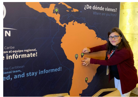
Where do you come from? A participant put a pin on her country at ICANN's booth

ICANN's Latin American and Caribbean team joined the regional Internet community in Panama City, Panama, from 7-11 October for the LACNIC32-LACNOG2019 meeting. Each year, the Latin American and Caribbean Internet Addresses Registry (LACNIC) and the Latin American and Caribbean Network Operators Forum (LACNOG) partner to host this joint meeting to discuss important issues and find solutions to common challenges related to the critical infrastructure of the Internet. ICANN's regional team talked about DNS privacy, collaborative efforts with law enforcement agencies, and engaged at a more significant level with some of them through the new ICANN booth initiative. Find more information here .