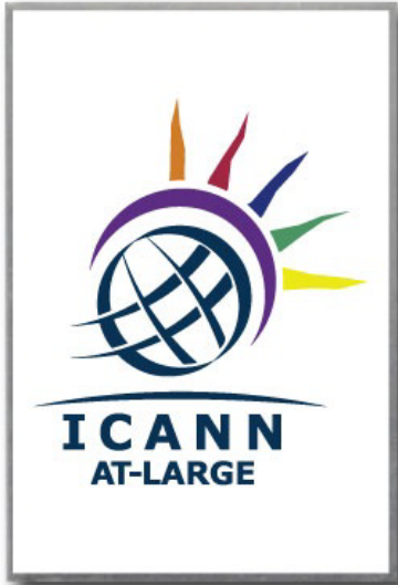
ENLARGED 400% TO SHOW DETAIL

Part #125 Actual Size: 1 9/32" x 7/8" Imprint Area: 1.2226" x .8168" Material: Stainless Steel Color: per your art file Blue = Safe area Black = Cut line Green = Bleed area