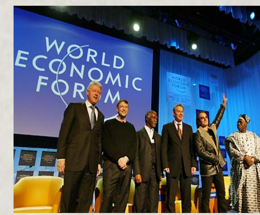
New civil society actors: the Clinton Global Initiative and the Gates Foundation