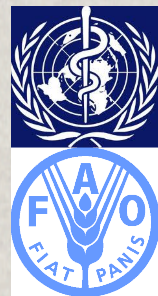
UN Specialized Agencies engage intensively and extensively with civil society groups