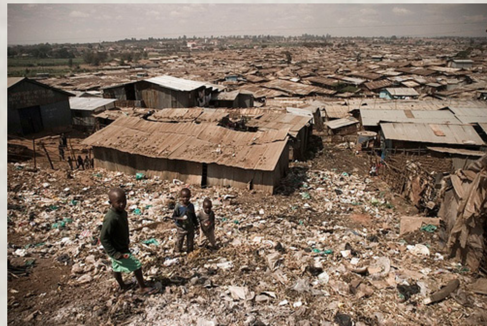
Civil Society is much bigger than the world of formally constituted NGOs that seek to address these issues